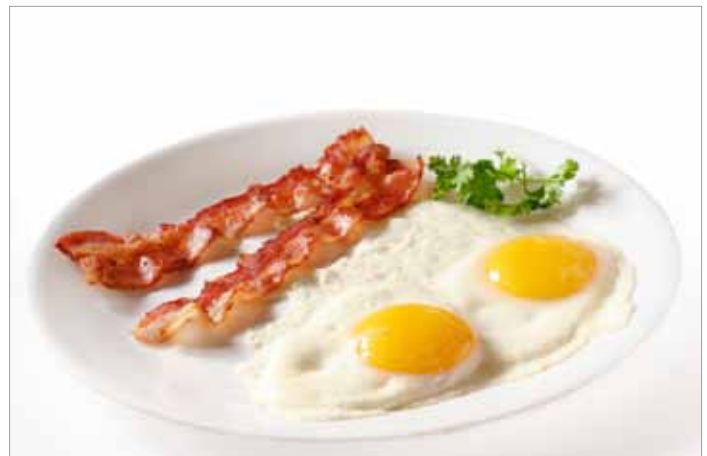
Bacon and eggs is a traditional meal that remains popular in homes and diners across the country.

And with low-sodium, lean and turkey varieties available, there are plenty of options out there for those with specific dietary needs.