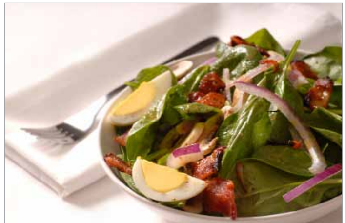
Bacon is a popular topping for salads, whether simply crumbled or as part of a hot salad dressing.